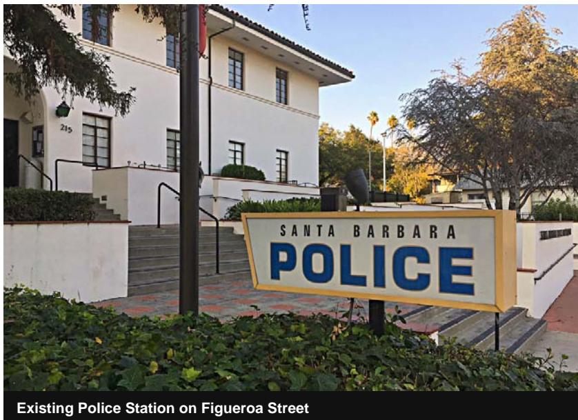
Existing Police Station on Figueroa Street

- Seismic Retrofit Study by Coffman Engineers, Inc. (September 2010)